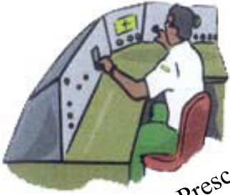
Tour the Prescott Flight Service Station